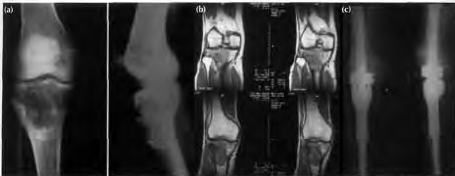
Figure 1 Preoperative (a) radiographs and (b) coronal T1-weighted magnetic resonance images showing malignant fibrous histiocytoma of the proximal tibia. (c) Follow-up radiographs after reconstruction with total knee prosthesis.

8–152) months. Survival rates were derived using the Kaplan-Meier survivorship analysis.